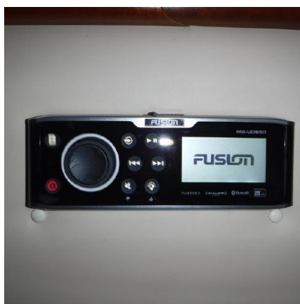
Fusion Bluetooth Stereo