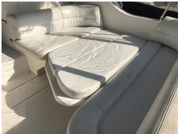
Sun Pad, Alt View