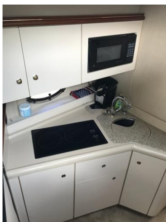
Double Burner Stove, Sink, Microwave