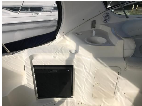
Wet Bar w/Sink, Fridge, and Storage