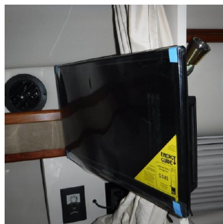
Jensen Flat Screen TV w/DVD Player