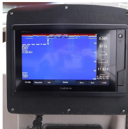
Garmin GPSmapxs Touch Screen Fish Finder