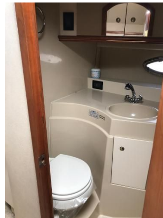
Vacu Flush toilet on Left