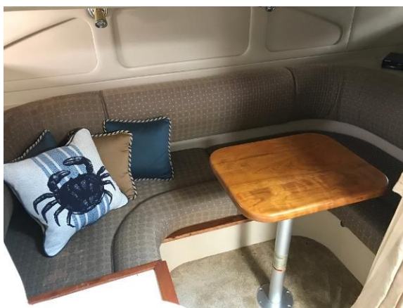
Aft Cabin Lounge