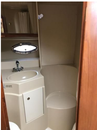
Shower Stall on Right