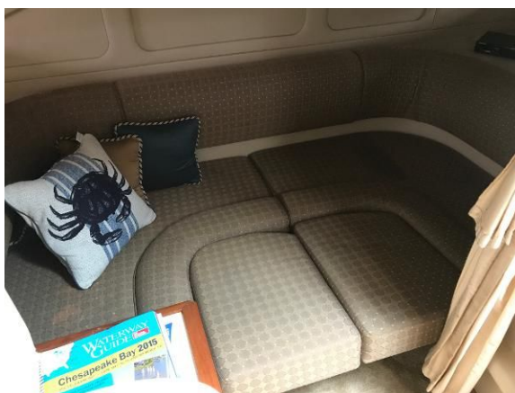
Aft Cabin Double Berth