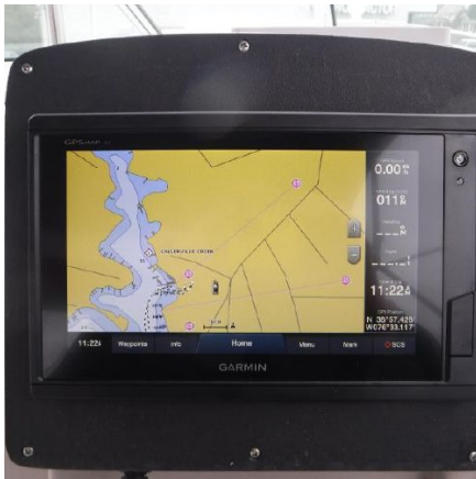
Garmin GPSmapxs Touch Screen GPS