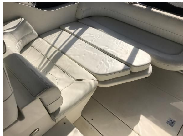
Cockpit Sun Pad