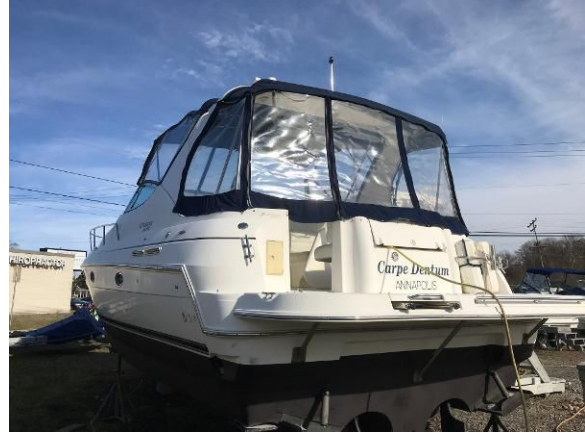
Stern w/Camper Enclosure