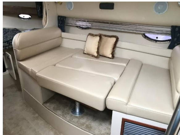
Dinette Converts to Twin Berth