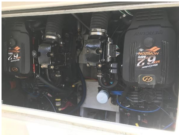
Twin 6.2 Ltr 320 hp Mercruiser HO Inboards