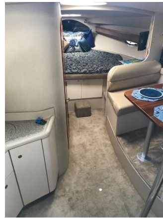
Cabin Entry View