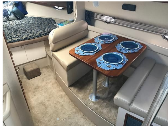
Dinette Seating to Starboard