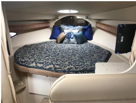
Island Forward Berth