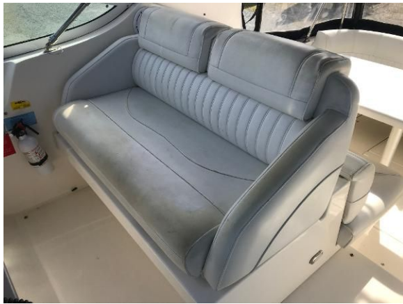
Double Wide Helm Seat