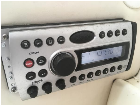
Clarion Stereo (in Cabin)