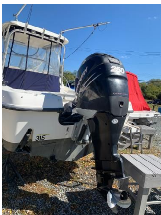
250 hp Mercury Verado 4-Stroke