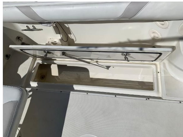
Port In Floor Fish Box