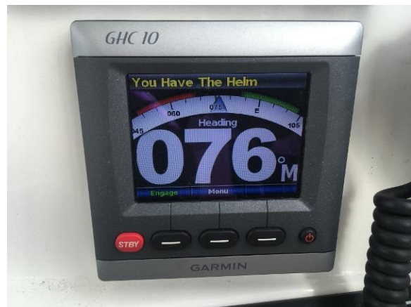
Garmin GHC 10 Auto Pilot