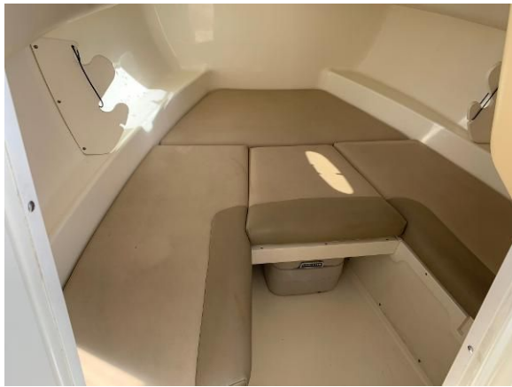
Cabin Filler Cushion for Berth