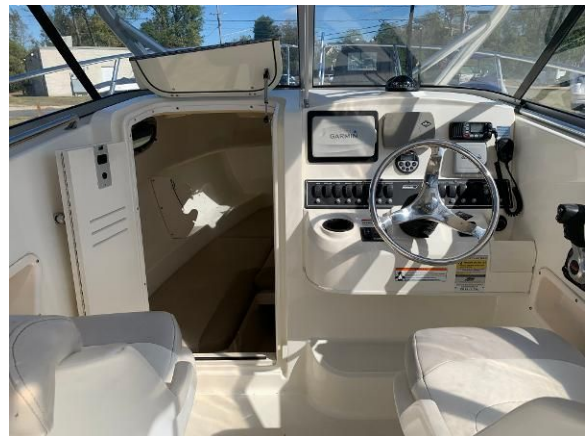
Raised Helm Area, Cabin Door