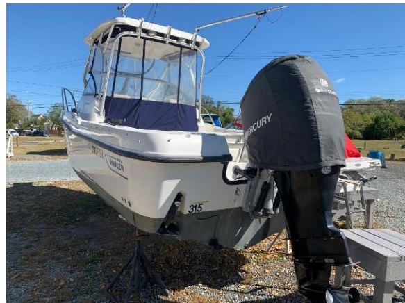
Stern w/Engine Cover On