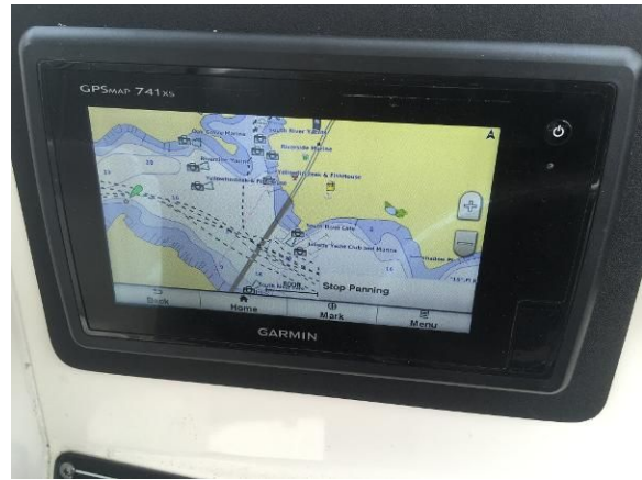
Garmin 741 xs Touch Screen GPS