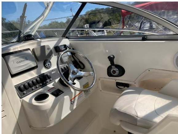
Helm Side View