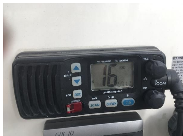
Icom VHF Radio