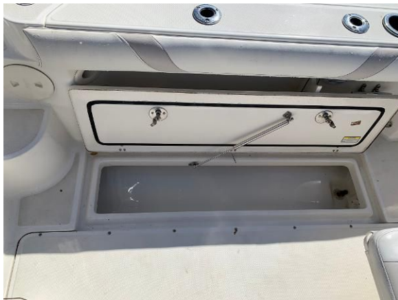
Starboard In Floor Fish Box