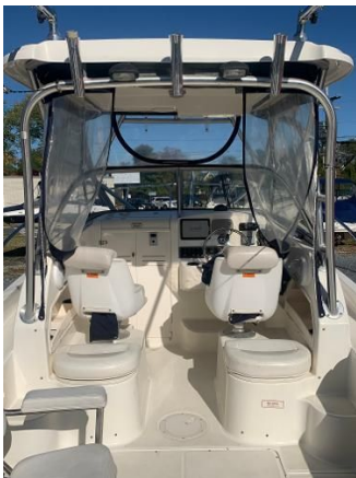
Aft Facing Cushioned Seats