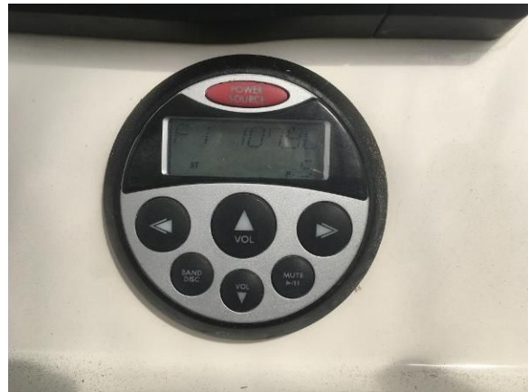
Clarion Stereo Helm Remote