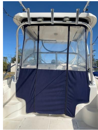
Full Raised Helm Enclosure w/Drop Curtain