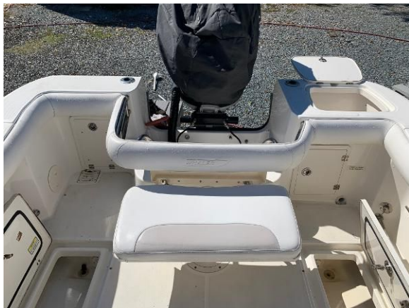
Folding Transom Bench Seat & Bait Well