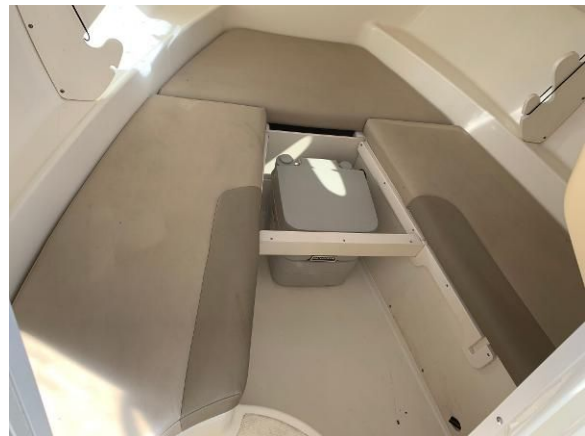
Cabin Toilet w/Pump Out