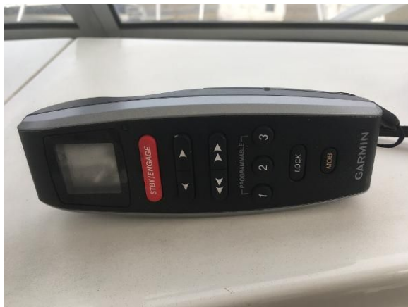
Garmin GHC 10 Auto Pilot Remote Controller