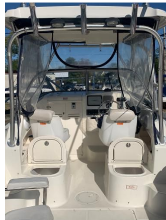
Aft Facing Seats - Open to Fish Box/Storage