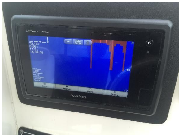
Garmin 741 xs Touch Screen Fish Finder