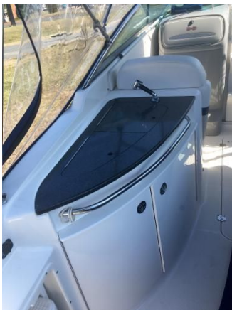
Wet Bar Entertainment Area