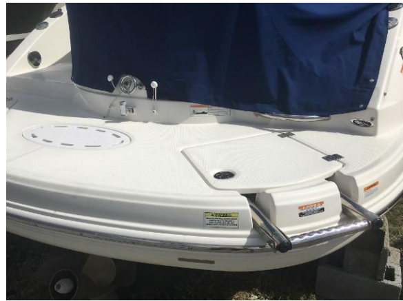
Extended Swim Platform w/Telescoping Ladder