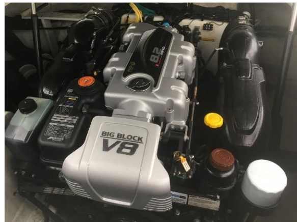
8.2 Ltr 380 hp Mercruiser MAG MPI