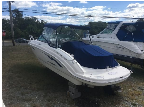
Stern View w/Enclosure & Custom Cockpit Cover