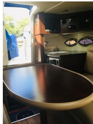
Cabin Facing Aft