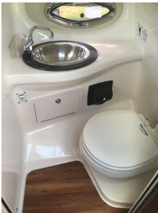
Head Sink & VacuFlush Toilet