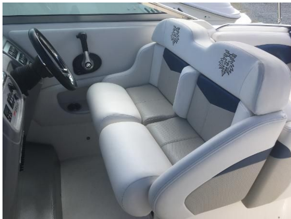
Double Wide Helm Seats w/Flip Up Bolsters