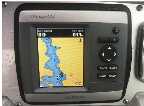
Garmin 441 GPS