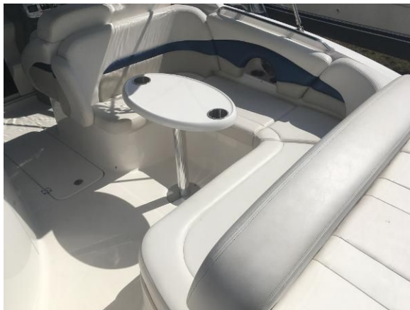
Cockpit Seating w/Removable Table