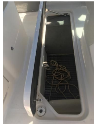
In Floor Oversized Gear Locker