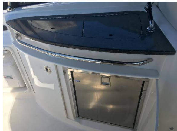
Wet Bar Fridge