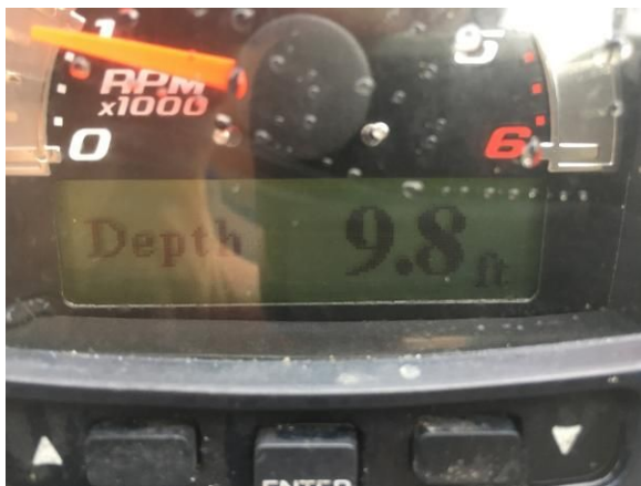
Chaparral Digital Gauges w/Depth Finder