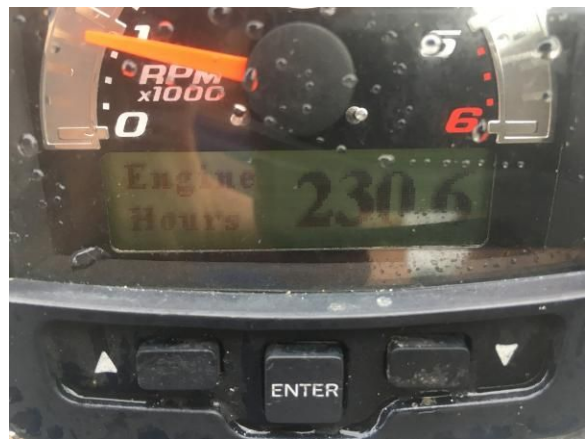
230.6 Engine Hours!