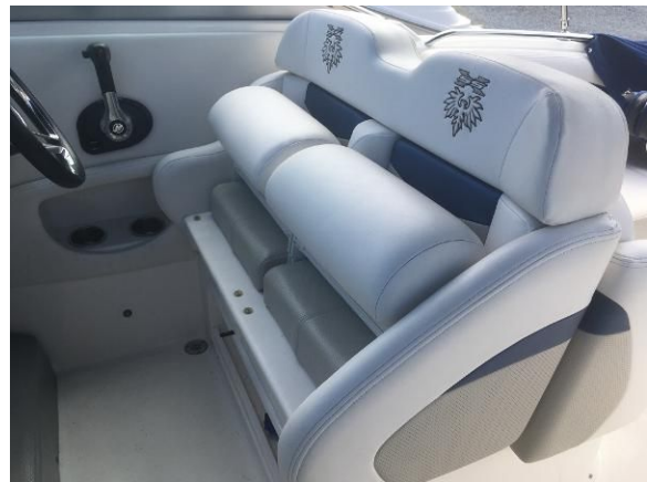
Helm Seats, Bolsters Up