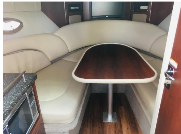
Cabin V-Berth Dinette