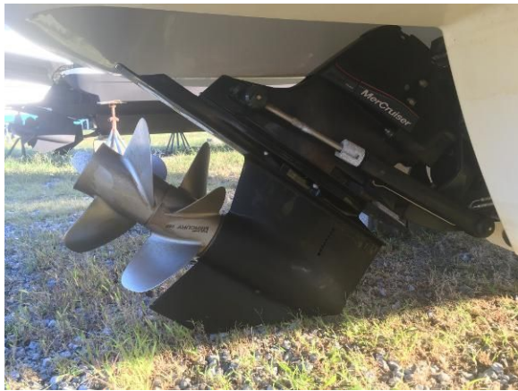
Bravo III Outdrive