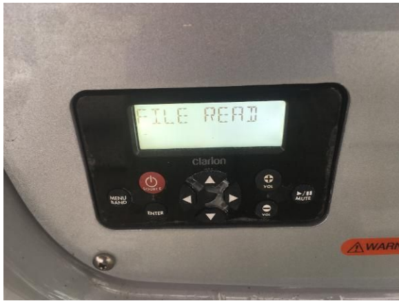
Helm Stereo Remote