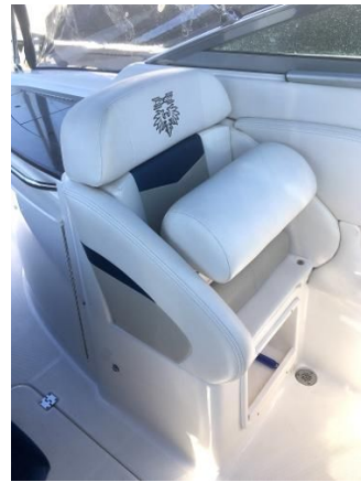
Companion Seat, Bolster Up