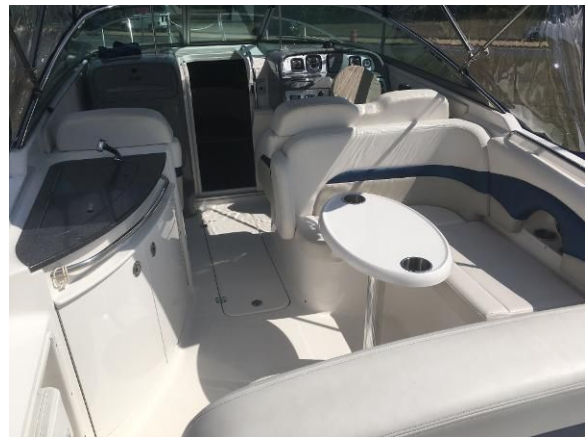
Cockpit Facing Forward