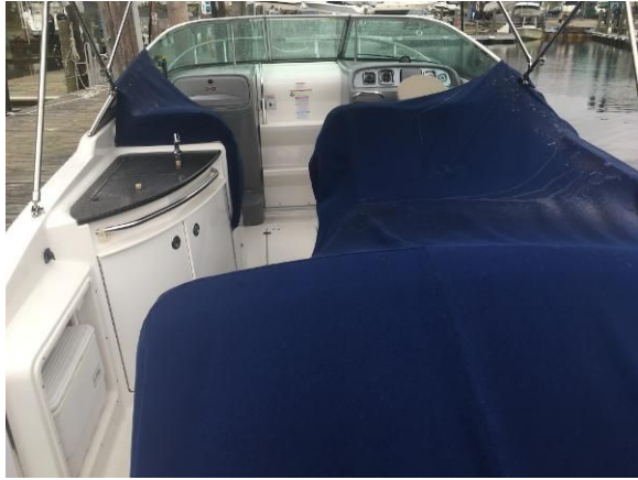
Custom Cockpit Covers