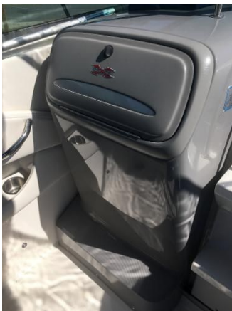
Companion Side Locker