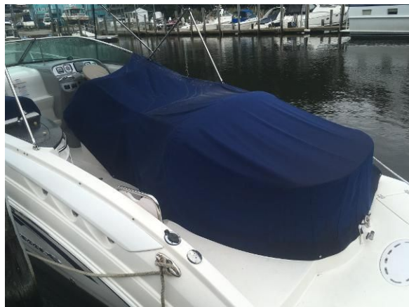
Custom Cockpit Cover