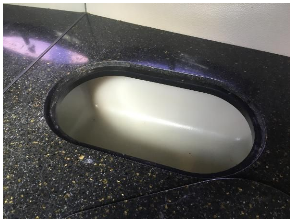
Galley Ice Box