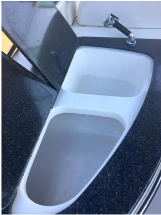
Wet Bar Sink & Inset Ice Chest