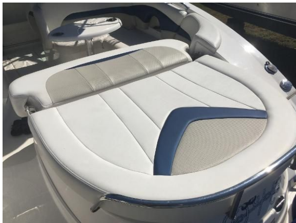
Transom Sun Pad