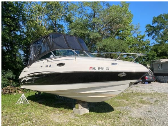
Starboard Bow w/Enclosure