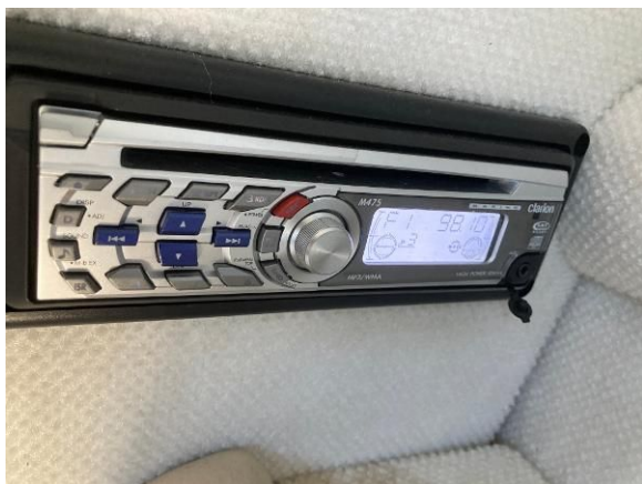
Cabin Clarion Stereo