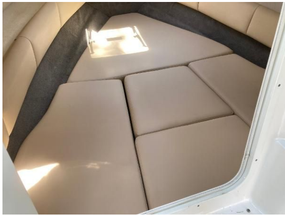
Cabin Double Berth