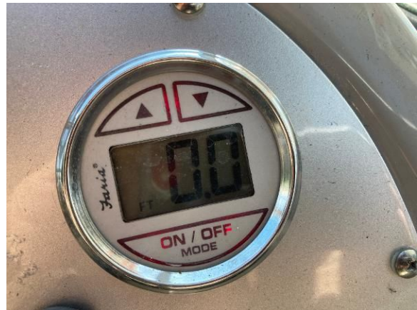
Faria In Dash Digital Depth Finder