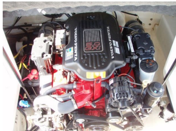
5.0 Ltr 270 hp Volvo Gxi