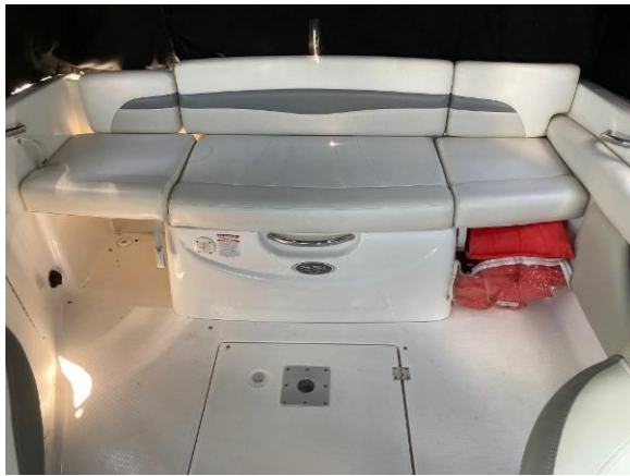
Transom Seating w/Removable Left/Right Seats