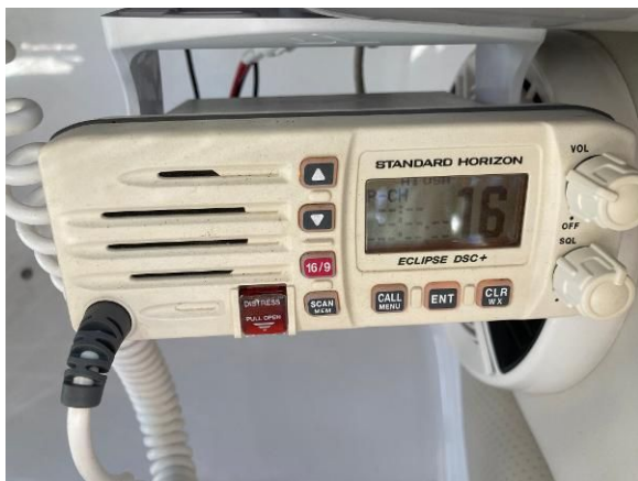
Standard Horizon VHF