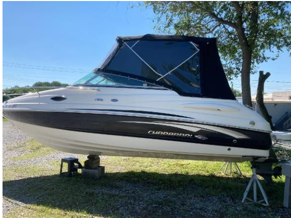
Port Side View