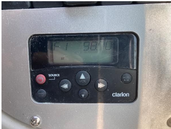
Clarion Cabin Stereo Helm Remote