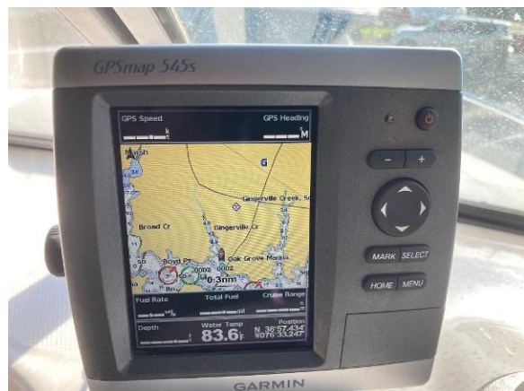
Garmin 545s GPS