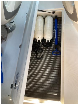
Cockpit In Floor Oversized Gear Locker