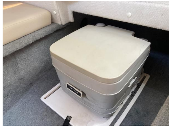
Port o Pottie w/Pump Out