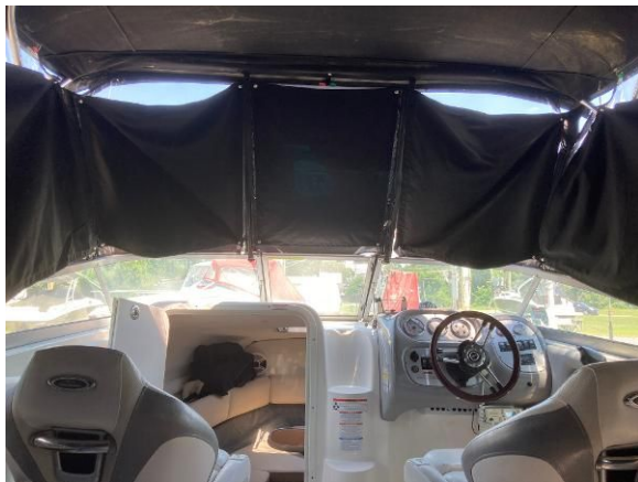
Snap In Shade/Privacy Curtains