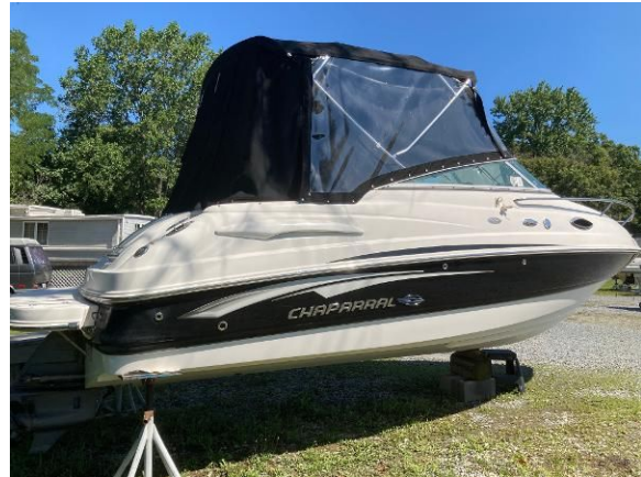
Starboard Side View