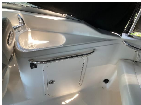
Wet Bar Fresh Water Sink