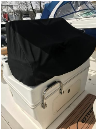
Helm Seat Cover