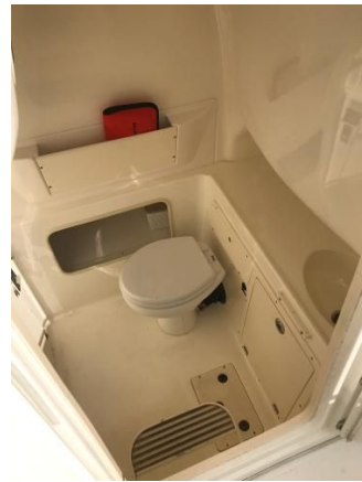
Private Head w/Sink & Vacuflush Toilet