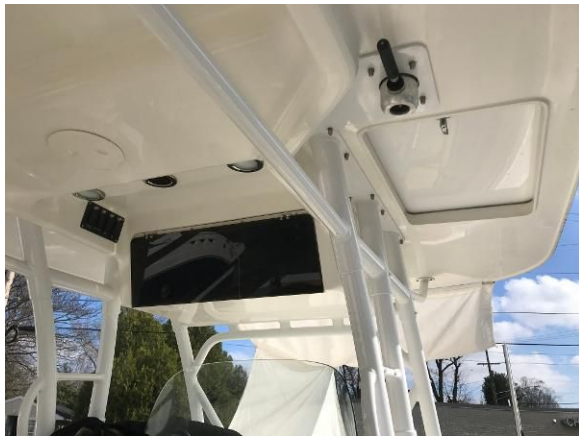
Hard Top Access Panel