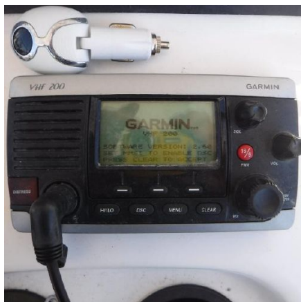
Garmin 200 VHF Radio