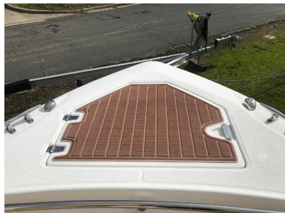
Bow Casting Platform