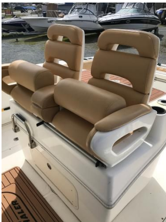
Double Helm Seats