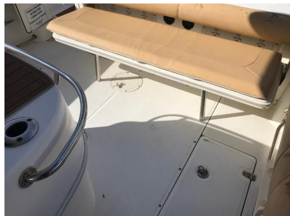
Foldable Transom Bench Seat