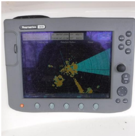
Raymarine C120 Radar