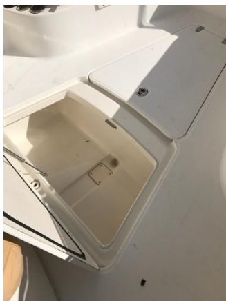
In Floor Fish Box