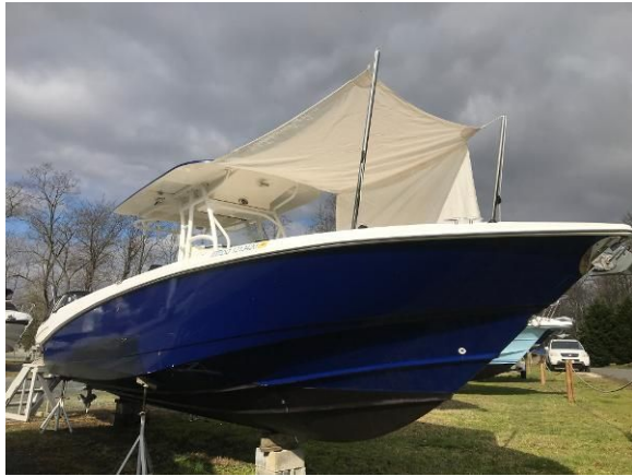
Starboard Bow w/Bow Shade Cover