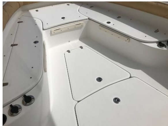
Bow Storage/Fish Boxes