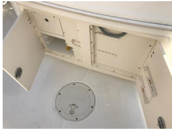
Tackle & Knife Storage