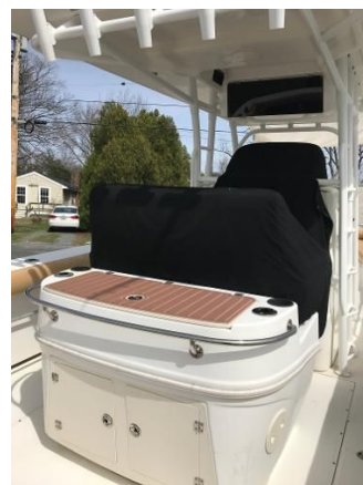
Prep Station, Helm