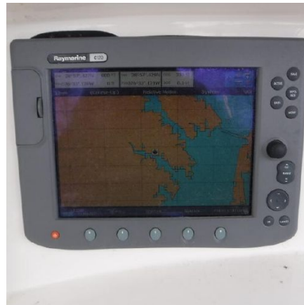
Raymarine C120 GPS