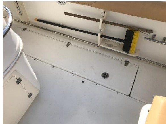
Starboard Gunwale Storage & In floor Fish Box