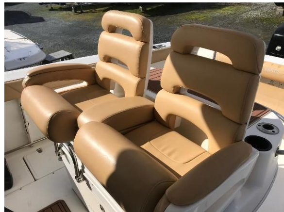
Double Seats w/Flip Up Bolsters