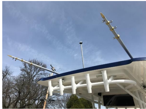
Rocket Launchers & Outriggers