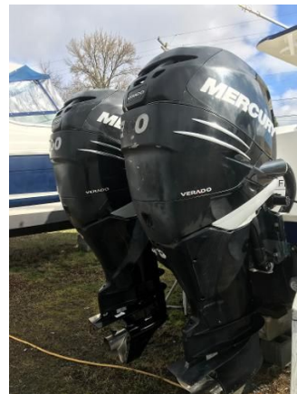
Twin 300 hp Mercury Verados