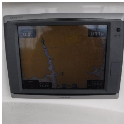
Garmin GPSmap 7212 GPS