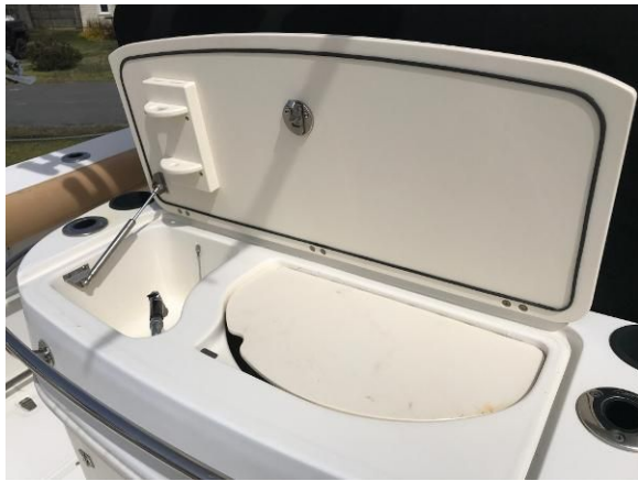
Fresh Water Sink, Cutting Board