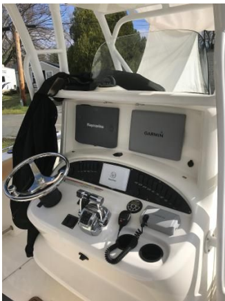
Helm w/Full Instrumentation