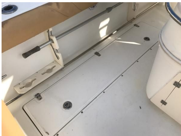
Port Gunwale Storage & In floor Fish Box