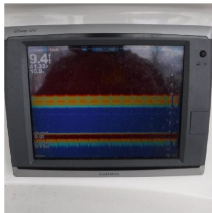
Garmin GPSmap 7212 Fish Finder