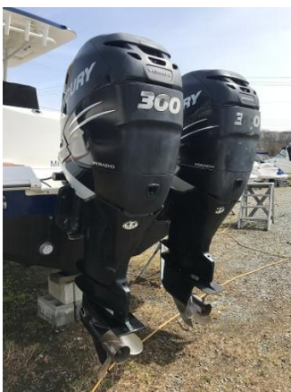
Twin 300 hp Mercury Verados